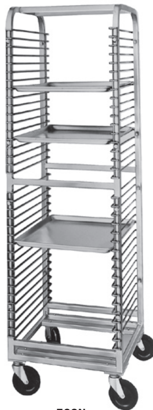
560N Front Load

Manufactured for standard bun pans. Sides allow for varied spacing options.