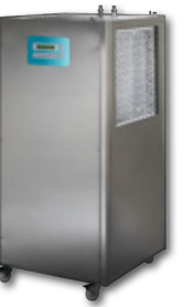
Professional Water Chiller

STM offers 24 MONTHS WARRANTY on the whole DOMIX line.