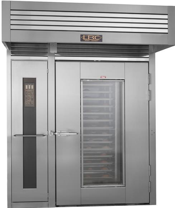
Model LRO-2G5 Shown (Rack not included)