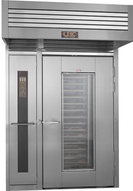
Model LRO-1G4 Shown (Rack not included)